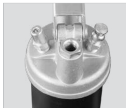
Aluminium die cast head with bulk loader and air bleeder valve